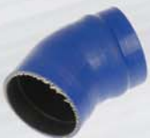
Turbo Outlet Hose