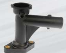
Filler Neck & Thermostat