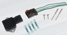
Radiator Fan Relay Kit