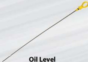
Oil Level Dipstick