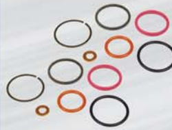
Diesel Fuel O-Ring Kit