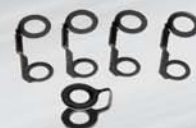
Diesel Return Line Gasket Kit