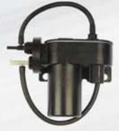
Diesel Vacuum Pump