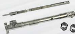
Steering Shift Tube