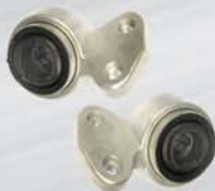
Control Arm Bushings