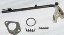
Coolant Adapter Pipe