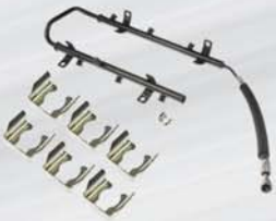
Fuel Rail Kit