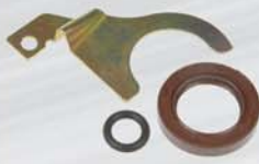
Counterbalance Shaft Seal and Retainer Kit