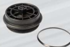
Diesel Fuel Filter Cap