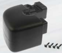
Bumper Cap LF