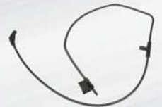
Windshield Washer Hose

New Product Idea? Contact Our New Product Team at 800-868-5777, ext. 5329