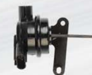
Vacuum Intake Control