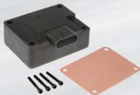
GM Diesel Pump Mounted Driver