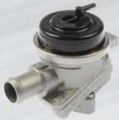
Air Check Valve