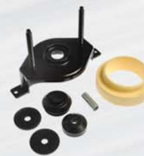
Upper Shock Mount