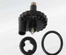
Water Separator Valve