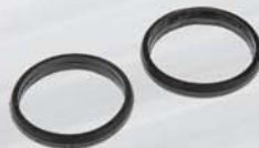
Cylinder Head Plug Seals