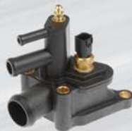
Coolant Air Bleeder