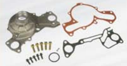
Water Pump Housing Kit