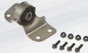
Torsion Bar Mounts