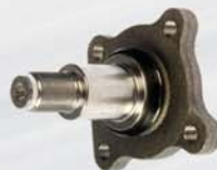
Spindle Stub Shaft