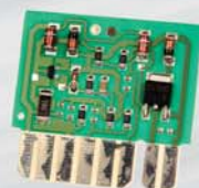
Daytime Running Lamp