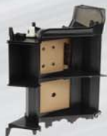
Blend Door Repair