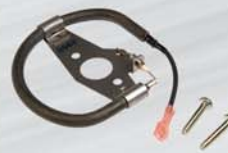
Diesel Fuel Heating Element