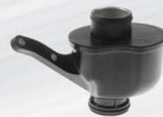
Turbo Vibration Dampener