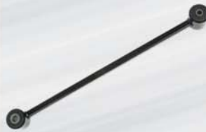
Rear Trailing Arm