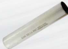
Spark Plug Tube