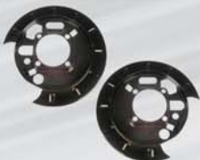
Brake Dust Shields