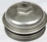
Oil Filter Cap