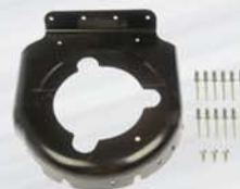
Strut Tower Cap Kit