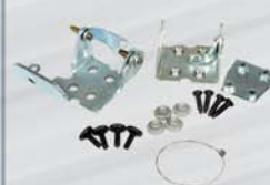
Door Hinge Assemblies