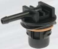
Fuel Tank Vent Valve