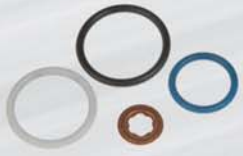
Fuel Injector O-Ring Kit