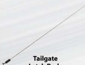
Tailgate Latch Rods